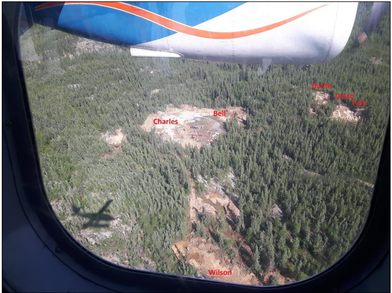
Figure 2: Aerial view of excavating to-date on 6 REE zones at Alces Lake. No scale available.